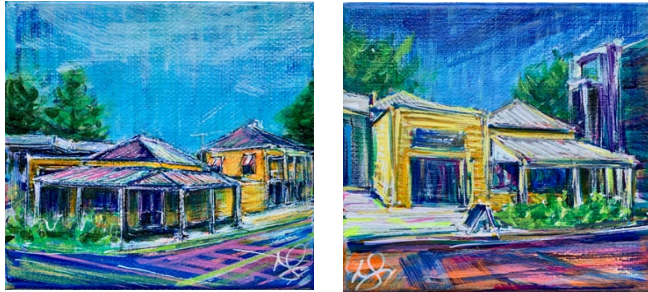
West End Corner Store View 1 and 2

Gifts of the business owner to friends who have supported their business