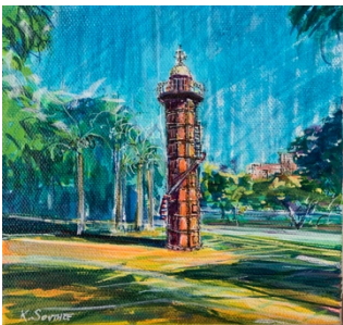
West End historic Gastower