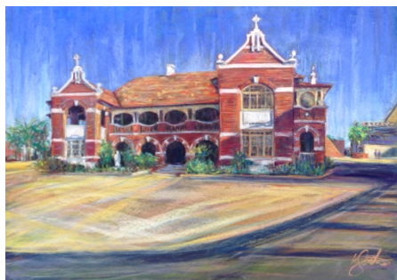
St Laurence's Boys College: Reception Building/Former Monastery

Corporate Commission: St Laurence's asked me to capture their most significant building for the school's Centennial Year in 2015. It was a great honour.