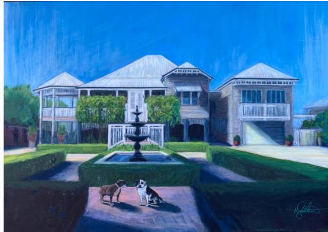
Chelmer Home, Brisbane

A birthday gift from her to him. A nice challenge: this wide view was obscured by several mature trees. To enable the home to be portrayed I needed to take multiple close up reference photographs then zoom out again for the composition to work. And the family dogs were incorporated to greet the guests coming through the gate.