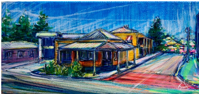
West End Corner Store View 3

Gift of the business owner to friends who have supported their business