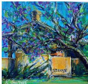
Auchenflower Home, Garden View

Corporate Commission: Highlighting a small snippet of a beautiful residence with their prized jacaranda in bloom.