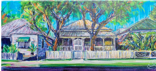
West End Workers' Cottage

A wedding anniversary gift from her to him, to celebrate the home that they purchased together a year earlier.