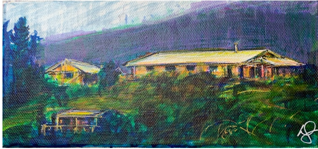
Riverstone, New Zealand

Christmas gift from her to him to honour what they built together: A property on a hillside amongst the forest with main home, shed and hut below the ridgetop.